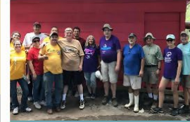
GLOBAL HUMANITARIAN HONOREE OUTREACH PROGRAMS OF SALEM LUTHERAN CHURCH